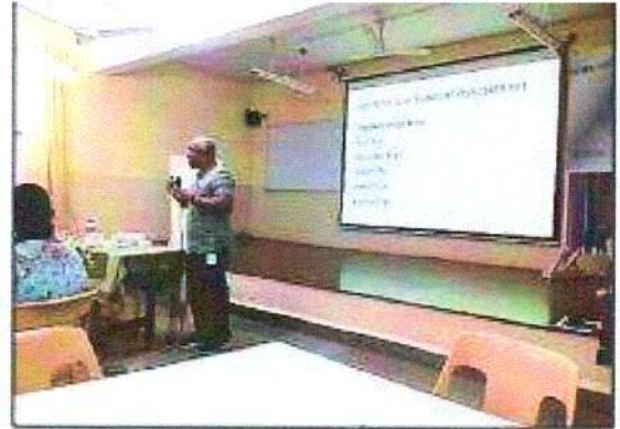
College Teaching Staff