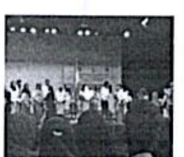
Mahatma Gandhi Martyrdom