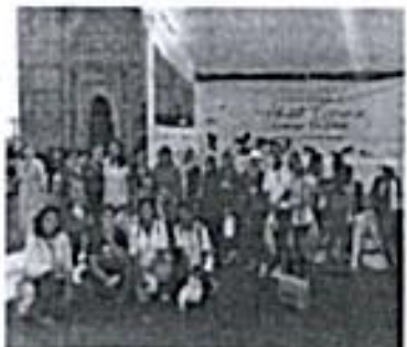
Bachpan Bachao Andolan