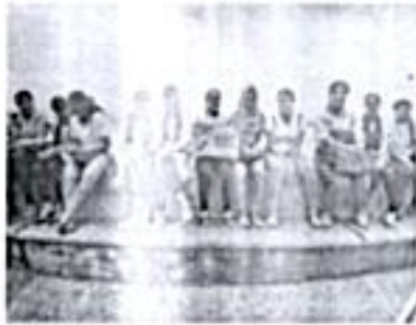
Rally For Organ Donation

Swachh Bharat Abhiyan Promotion Youth For A Better