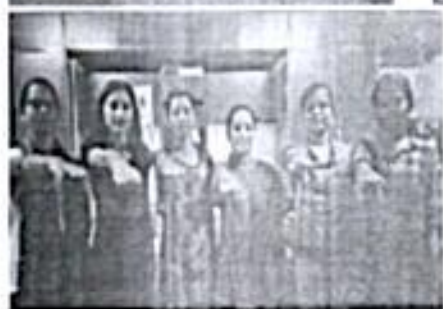
Oath Taking Peace Walk with Posters