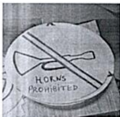
Safety and Road symbols