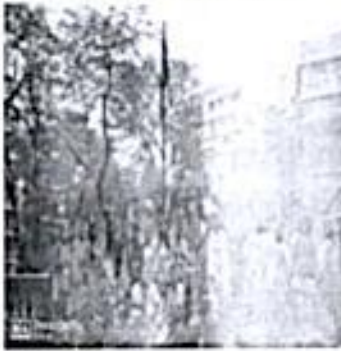
Republic Day Flag Hoisting