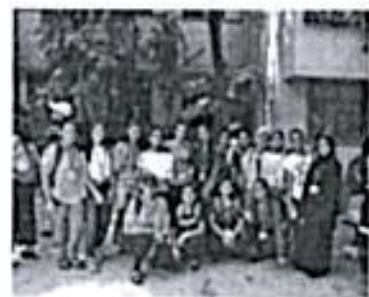
Save Environment Rally