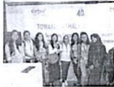
Thalassaemia Free India Camp