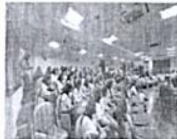
NSS Formal Orientation