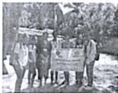
Azad Maidan Rally On No Drugs