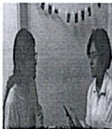
Poster Making Awareness