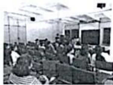
NSS Informal Orientation