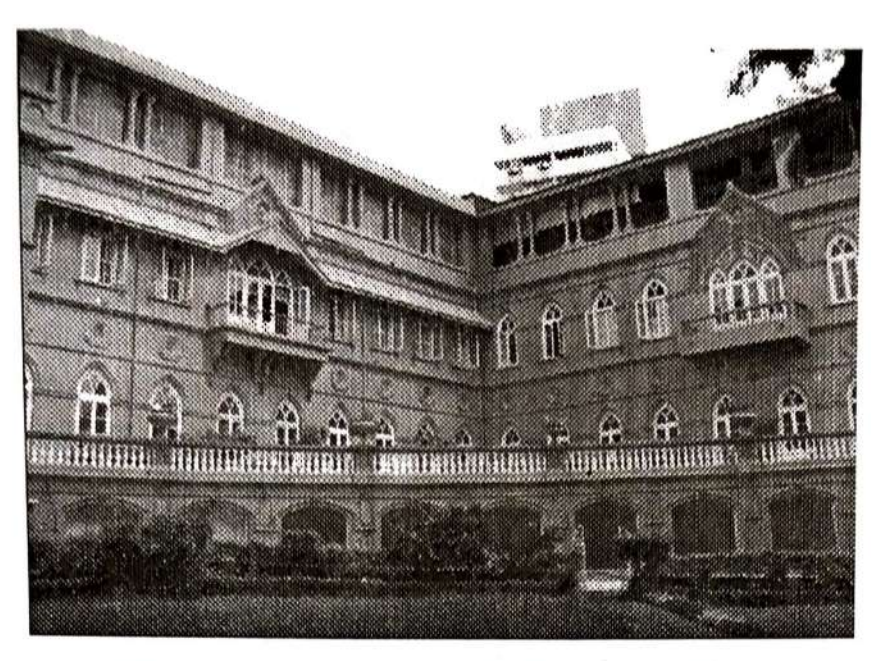
SOPHIA COLLEGE, MUMBAI