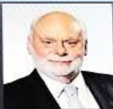
Sir J. Fraser Stoddart Northwestern University, Evanston, IL, USA