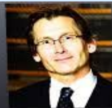
Bernard L. Feringa University of Groningen, the Netherlands

20 th of January 2017, 11:30 am In the a.v. room Sophia college campus (Supported by dbt Star College)