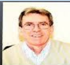
Jean-Pierre Sauvage University of Strasbourg, France

The Nobel Prize in Chemistry 2016 was awarded jointly to Jean-Pierre Sauvage, Sir J. Fraser Stoddart and Bernard L. Feringa " for the design and synthesis of molecular machines ".